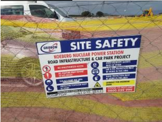
Image 9: Notice informing employees of KNPS of the presence of a construction site.