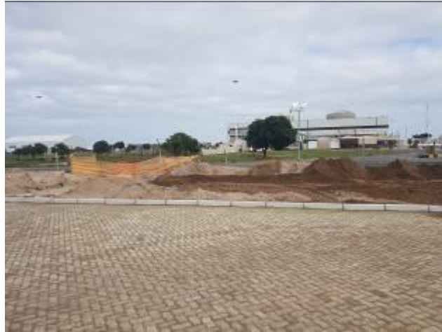
Image 19: Previously excavated material stockpiled (cleared topsoil).