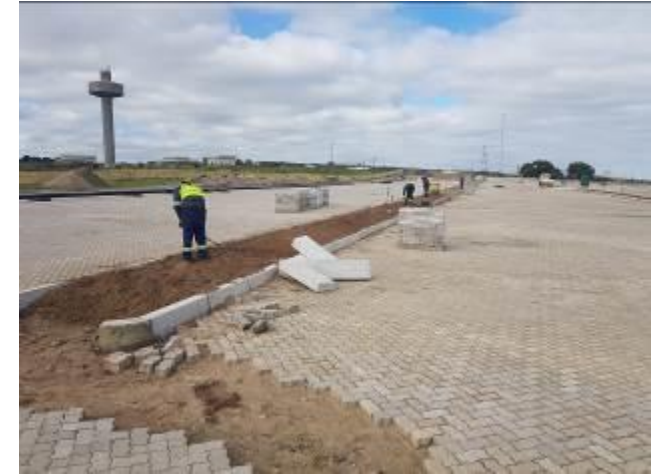
Image 20: Backfilling of curbs with PREVIOUSLY excavated material (cleared topsoil).