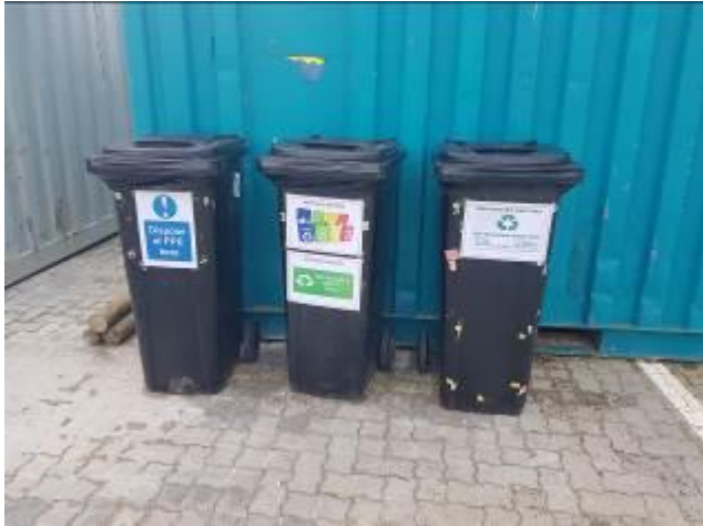
Image 18: Seperate waste recepticals provided within the site camp.