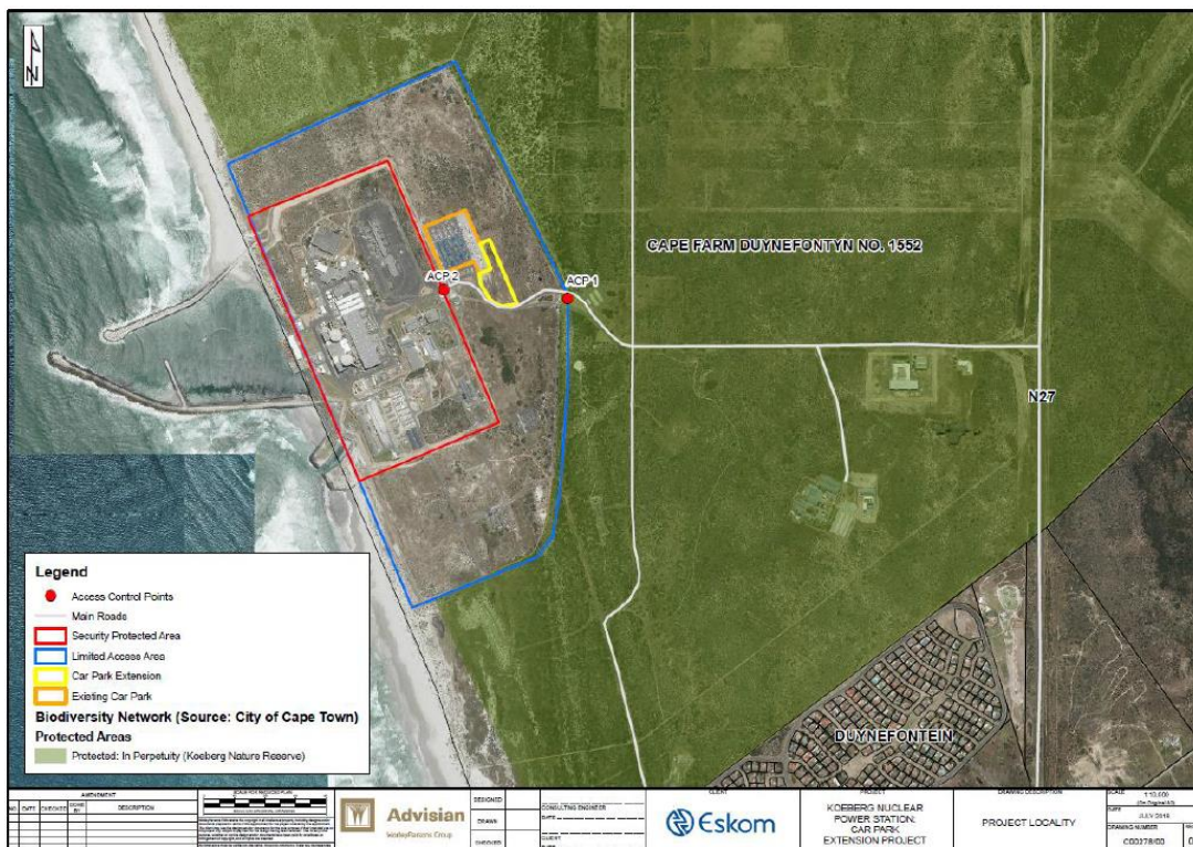
Figure 2: Site locality within Koeberg Nuclear Power Station.