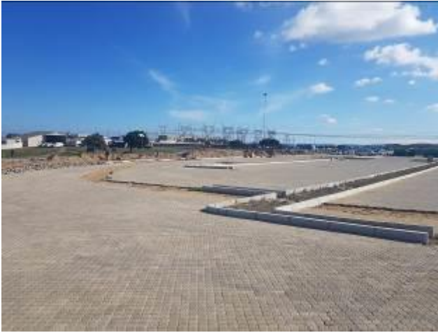
Image 7: Laid paving infrastructure and construction of stormwater drain.